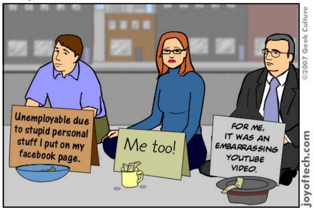
Signs of the social networking times.